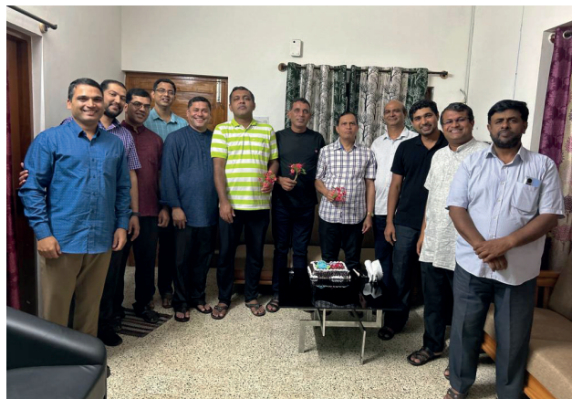
Triple Birthday Celebrations at Geddalahalli