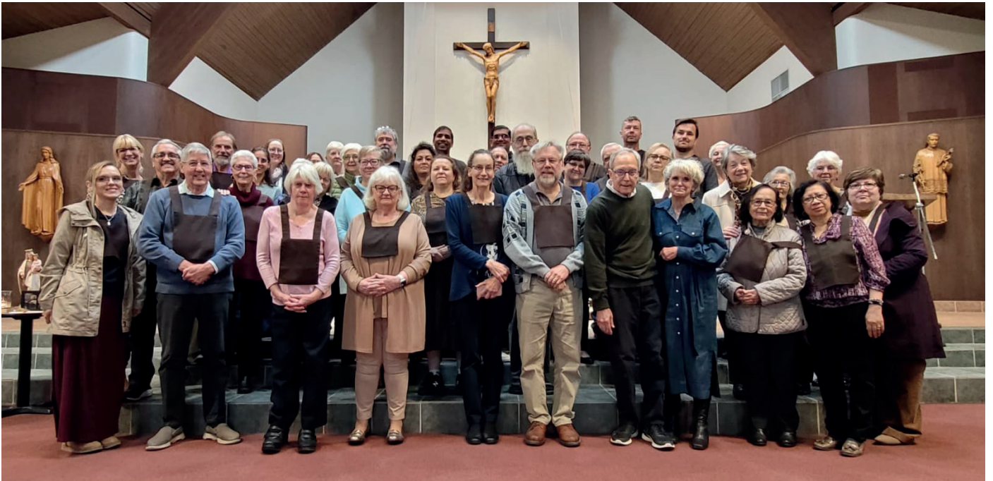
OCDS Regional Recollection at St Aloysius Parish, Kitchener, Ontario