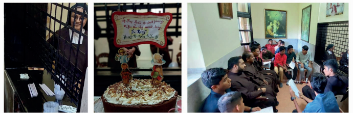
Avila Jyothi Community visited Chicalim Carmel