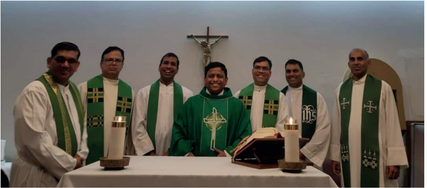
Ontario Regional Gathering at Oakville, Canada

B. Living Rosary in the month of the Holy Rosary! Praying for the Missionary work around the world and for peace in the Middle East, the parishioners of St. Mary's Hagersville ON offered the Living Rosary to our Lady on the weekend of October 21 & 22. It was done after 5:00 pm mass on Saturday and 10:30 am mass on Sunday, which was World Mission Day. St. Ann's Parishioners prayed the Living Rosary on Sunday, October 29 after 8:30 am mass. The CWL members took the lead and helped the people to pray with great devotion.